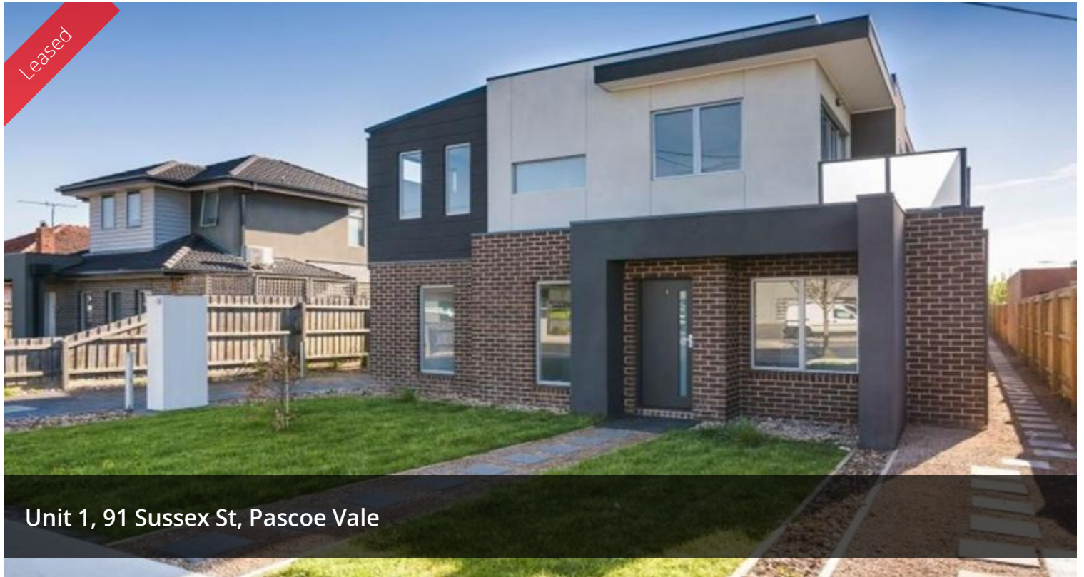
Unit 1, 91 Sussex St, Pascoe Vale