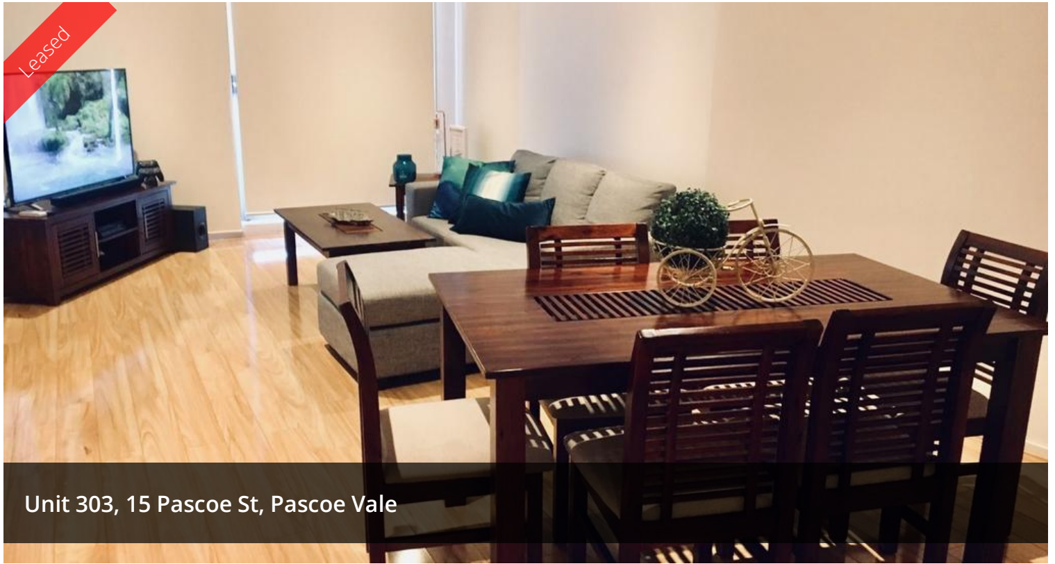
Unit 303, 15 Pascoe St, Pascoe Vale